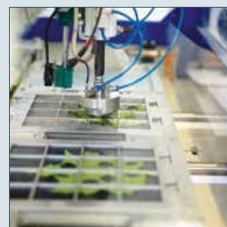
Cutting leaf discs within the phenotyping platform.