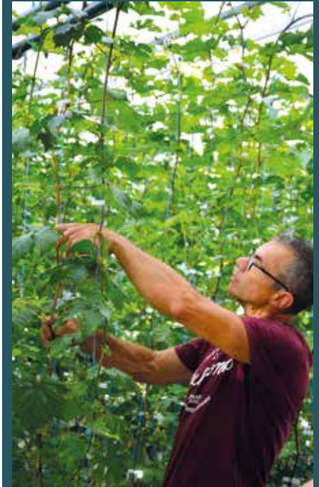
Through vine training in the greenhouses, the pip-to-pip cycle is reduced to 1 year, compared to 3 years in natural conditions.

Inaugurated in 2019, Phenotis is a unique and original experimental device specifically designed to support grapevine research programmes: To assess the level of resistance to downy mildew and powdery mildew, to monitor the development of vines in real time and in the open field, to identify the compounds contributing to the quality of the grape berry and to explore new strategies for combatting the fanleaf virus and its vector nematode. It includes 1000 m 2 of greenhouses with high environmental quality allowing the cultivation of vines in pots or tubs to study the natural transmission of the fanleaf virus. The Phenotis operation, at a total cost of nearly €2.5 million, was co-financed as part of the 2015-2020 State-Region Planning Contract with the support of Europe (FEDER).