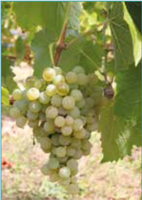
Floreal, an INRAE variety resistant to downy mildew and powdery mildew, for making aromatic white wines, with notes of exotic fruits and boxwood.