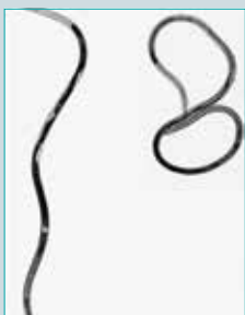
Nematodes, microscopic worms present in the soil, are particularly effective vectors of the virus responsible for the fanleaf virus.

The grapevine fanleaf virus (court-noué virus) induces diebacks causing severe crop losses. This is one of the main problems for French vineyards. This viral disease is transmitted by a nematode – a microscopic soil worm. The Grand Est-Colmar Centre is exploring different ways of combatting the fanleaf virus by developing biological strategies, such as the induction of a resistance to the virus by pre-mutation and genetics, by researching natural resistance in certain Vitis accessions, and biotechnological strategies, by resistance induction. The effectiveness of nematicide falls in reducing vector nematode populations is also being evaluated. Research is also directed towards comprehensive knowledge of viral diversity in grapevines which allows, among other things, the development of new methods for detecting grapevine viruses via antibodies called nanobodies, which could, in time, be integrated into phytosanitary certification.